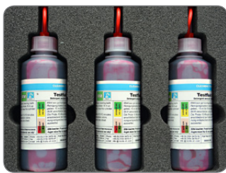
BA15 analysis fluid